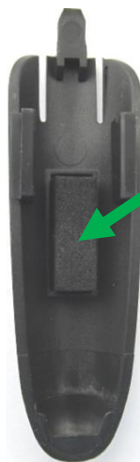
Foam pad 2931Z39010