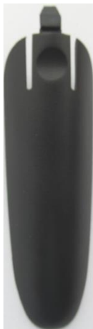
Battery cover 2931Z13020