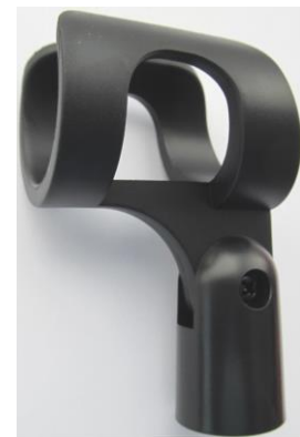
Optional, Stand adapter SA63, 6001H63010