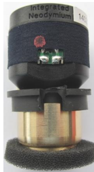
Capsule HT40, 1400M40010