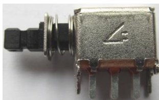
Switch (ON/OFF) 0040E02180