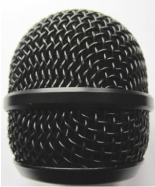
Grid cap HT40, 9999N07180